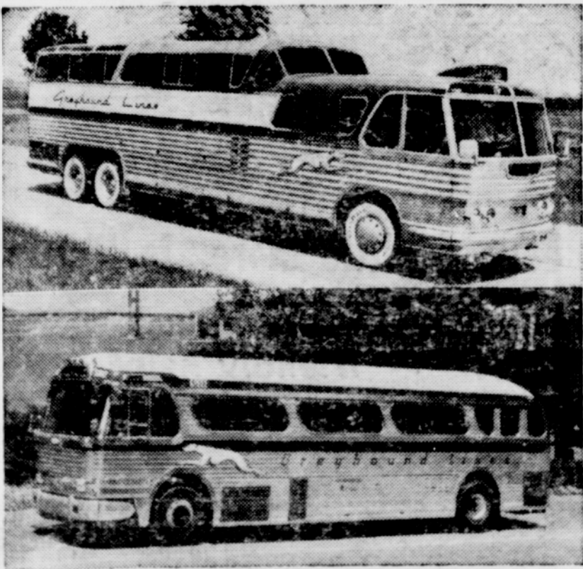
Pacific Greyhound Lines is getting 75 new "Scenicruisers" (top picture), and 50 more "Highway Traveler" air suspension buses (lower), it has been announced. They are part of a 200-bus order for 1954 delivery and will join 100 Highway Travelers, already received, in the expanding of no-extra-fare through-express service in the West and to the East.