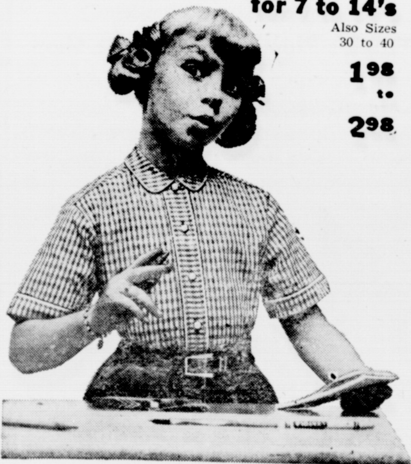
as seen in Good Housekeeping

Rollicking times ahead for these soft-tailored little SHIP'N SHORE'S! Fine combed cotton broadcloths, woven stripes 'n' checks 'n' plaids for school, sports, parties, too! Short or long sleeves... famous action shirts... slews of fashion details! Glow colors... ever washable.