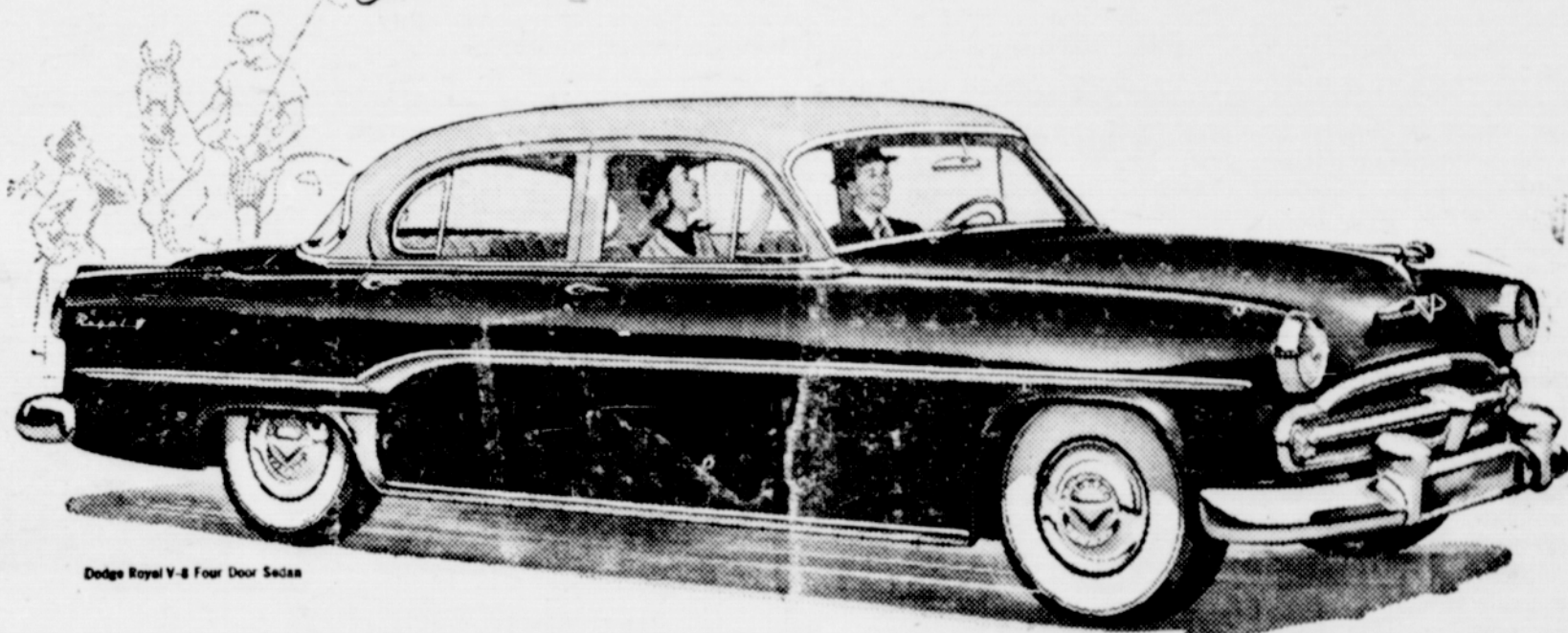
Dodge Royal V-8 Four Door Sedan