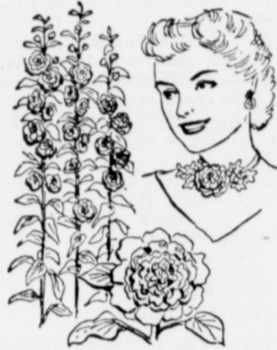
Beautiful in the garden — or as a floral necklace

Designing the necklace is easy. After leaving the bloom in cold water for a couple of hours to insure freshness, simply follow the four steps shown in the drawing.