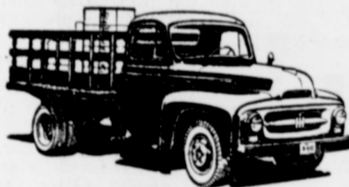
Three light-duty stock models, 1/2-ton to 8,600 lbs. GVW, 7 1/2 and 8 1/2-foot bodies.