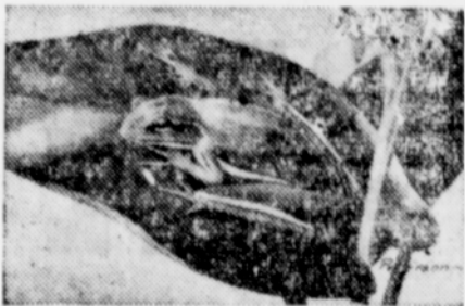
Green Tree Frog

2½ inches with the females being definitely larger than the males. The male is dark olive above with some orange spots scattered over the back. It is lighter on the side and there is a cream-colored streak which runs lengthwise of the side almost to the hind legs. The throat is green just under the mouth and the chin is cream-colored. Lower on the throat is a pinkish area that marks the wrinkled throat prop-