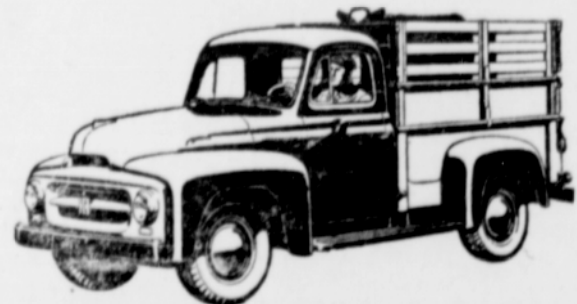
New Model R-120 pickup with Ad-A-Rak attachments.