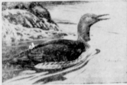
Red-Throated Loon

THE FACT that a bird has a wide range for its species does not mean necessarily that it is correspondingly well known. The red-throated loon ranges during the year from the Aleutians to Greenland and south to Florida and Lower California and yet most people go through their lives with-