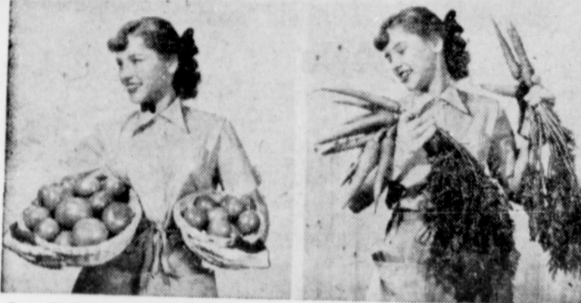
A synthetic soil conditioner that converts non-productive into productive soil in a matter of hours, is now being produced for western gardens in the Long Beach plant of the Monsanto Chemical Company. *

Initial production of Krillum, the original synthetic soil conditioner, is being devoted to a special formula developed for home gardeners which keeps the product dry and free-flowing and makes it easier to mix with the soil.