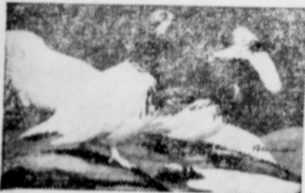
Willow Ptarmigan

Splotches of brown, mixed some black, cover the male's neck, up-