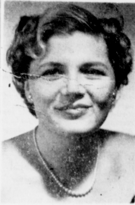
BRIDE, AUGUST 9TH