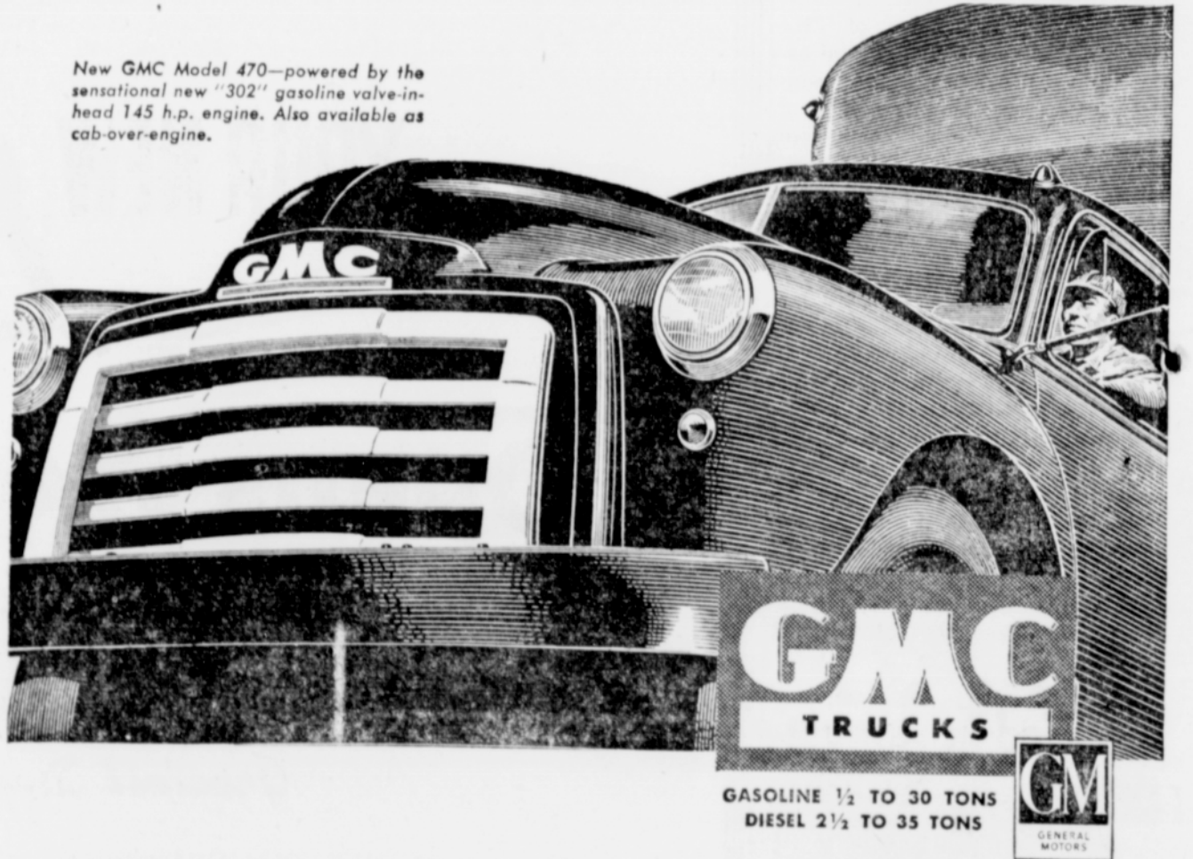
New GMC Model 470—powered by the sensational new "302" gasoline valve-in-head 145 h.p. engine. Also available as cab-over-engine.