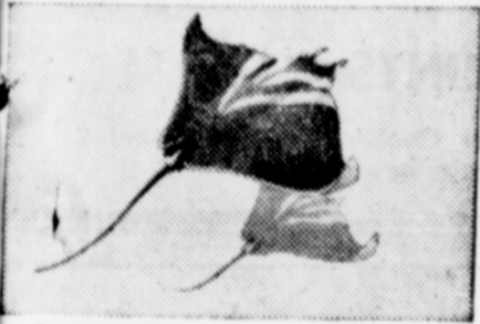
Pacific Manta

Islanders of the Pacific are brave people, but they shudder at the sight of a Manta. This strange giant has broad, flat fins which stretch out from the sides of its body like the wings of a bat. The natives believe that if a man should get near a Manta in the