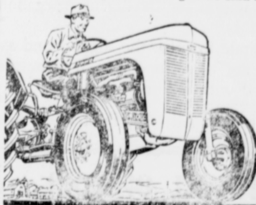
Copyright 1952 by Harry Ferguson, Inc.

The important thing to be said here is that performance such as this permits you to farm more land . . . easier, more intensively, and at lower cost. A "Showdown" demonstration on your farm will convince you of this. Telephone us and we'll quickly arrange such a demonstration for you.