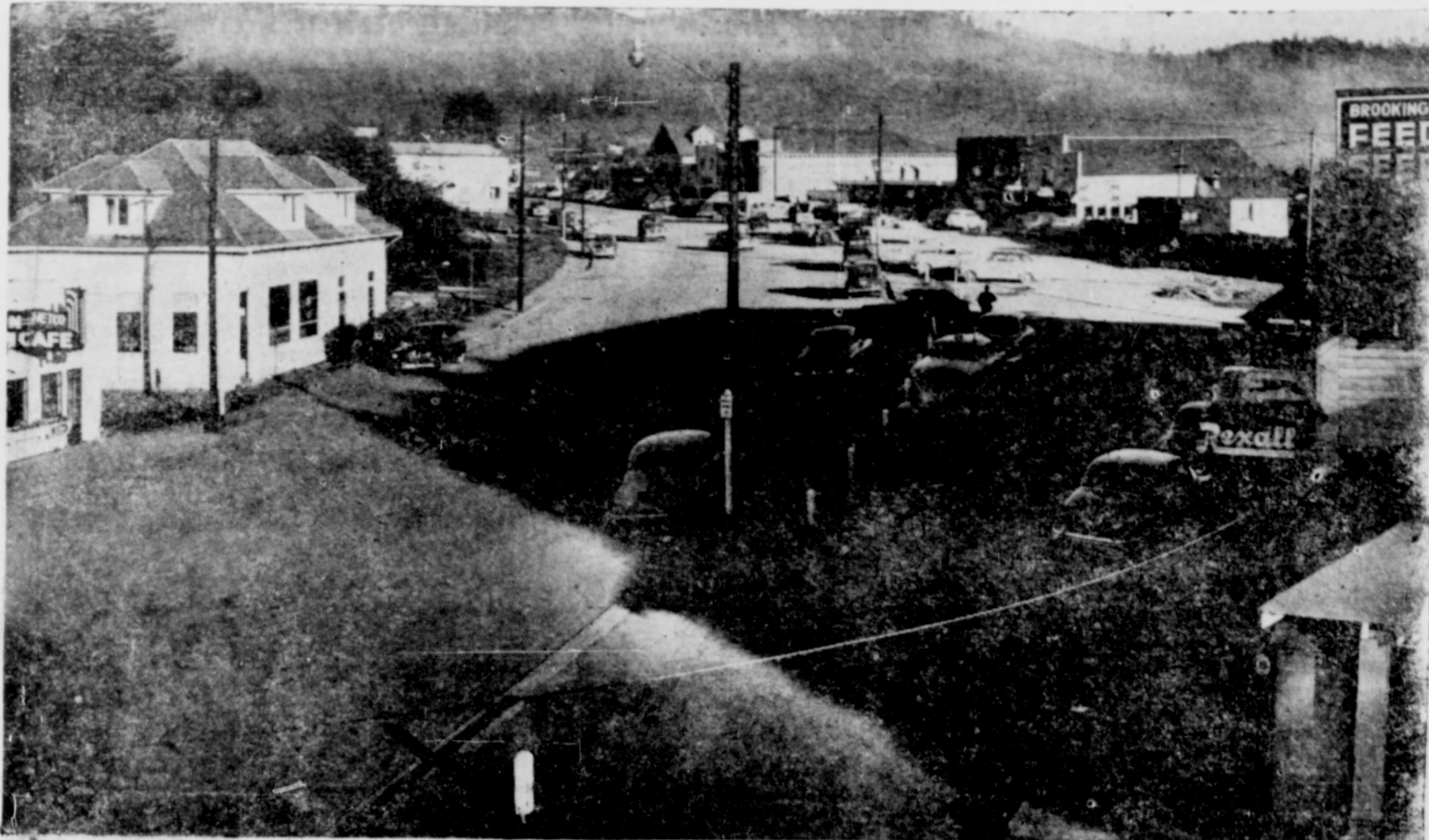
Beginning Of Plywood Plant Construction Last Summer Added Impetus To Industrial Growth of Curry County