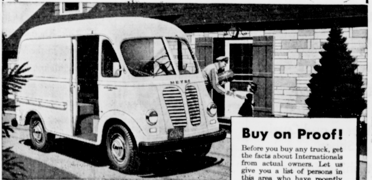
Model L-120 with 9 1/2 foot Metro body, 115 inch wheelbase.

*Metro. Registered trade mark of The Metropolitan Body Company, Inc., subsidiary of the International Harvester Company.