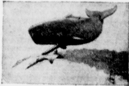
Sperm Whale

troleum industry and the invention of electric lights, whales were spared.