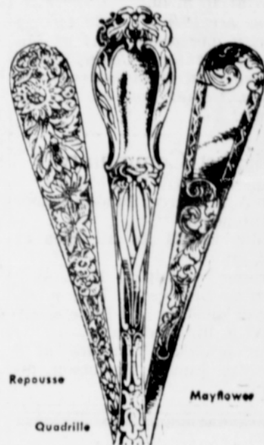
Reposse Quadrille Mayflower

Beauty of design, perfect balance and substantial weight distinguish the patterns of Kirk, America's Oldest Silversmiths, founded 1815. Remember too... Kirk patterns are not discontinued.