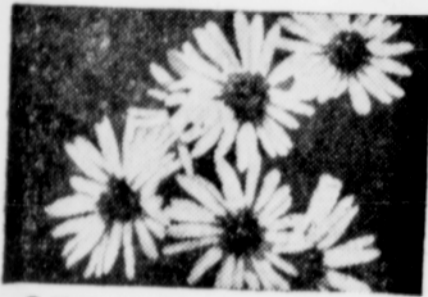
Calico Aster

"Why, those flowers remind me of stars; Their blossoms look as though they were sending out rays. Wouldn't it be a good idea to take aster, the Greek word for star, and give it to the plants?"