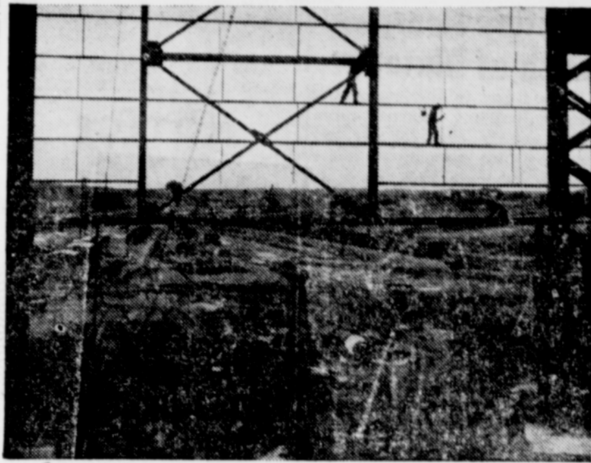
NEW STEEL FACILITIES TAKE SHAPE —Workman painting braces on the end of a new open hearth building. This new plant is part of the National Production Authority's program for the expansion of basic industry. It will play a major part in raising our steel capacity to 120 million ingot tons by the beginning of 1954.