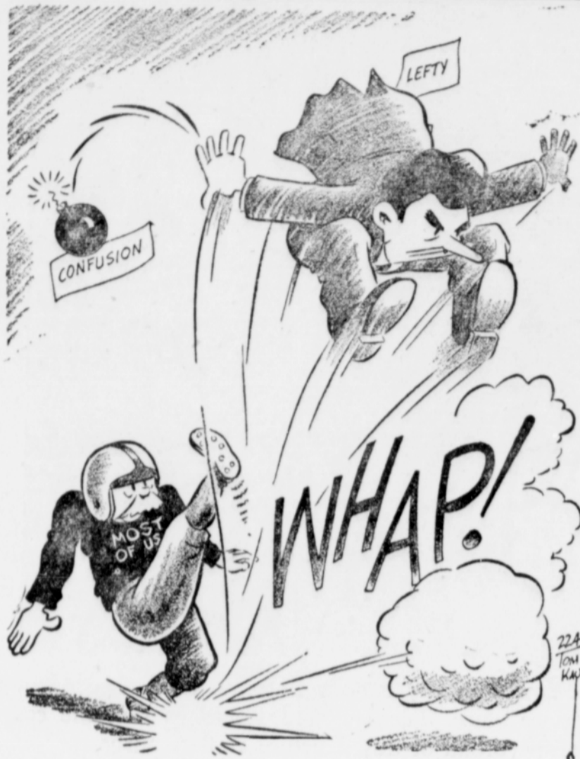
Getting The Boot

mitted to become stagnant. The movement, once on its feet, will be self-perpetuating I am sure. Interested persons behind this movement are irked beyond any words of expression.