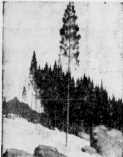
Lodgepole Pine

Wherever trees will grow in this region, the lodgepole pine is likely to be found. It grows from sea level to altitudes of 9,000 to 11,000 feet. It is at its best in