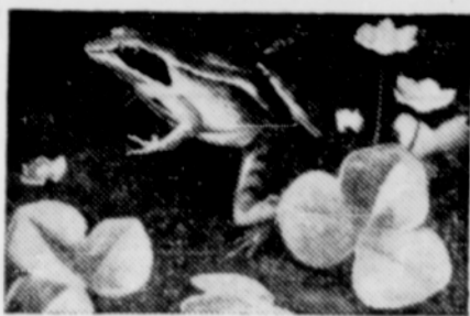
Wood Frog

If he were not such an athlete, the little fellow would never attract any attention. But when there is a disturbance near him,