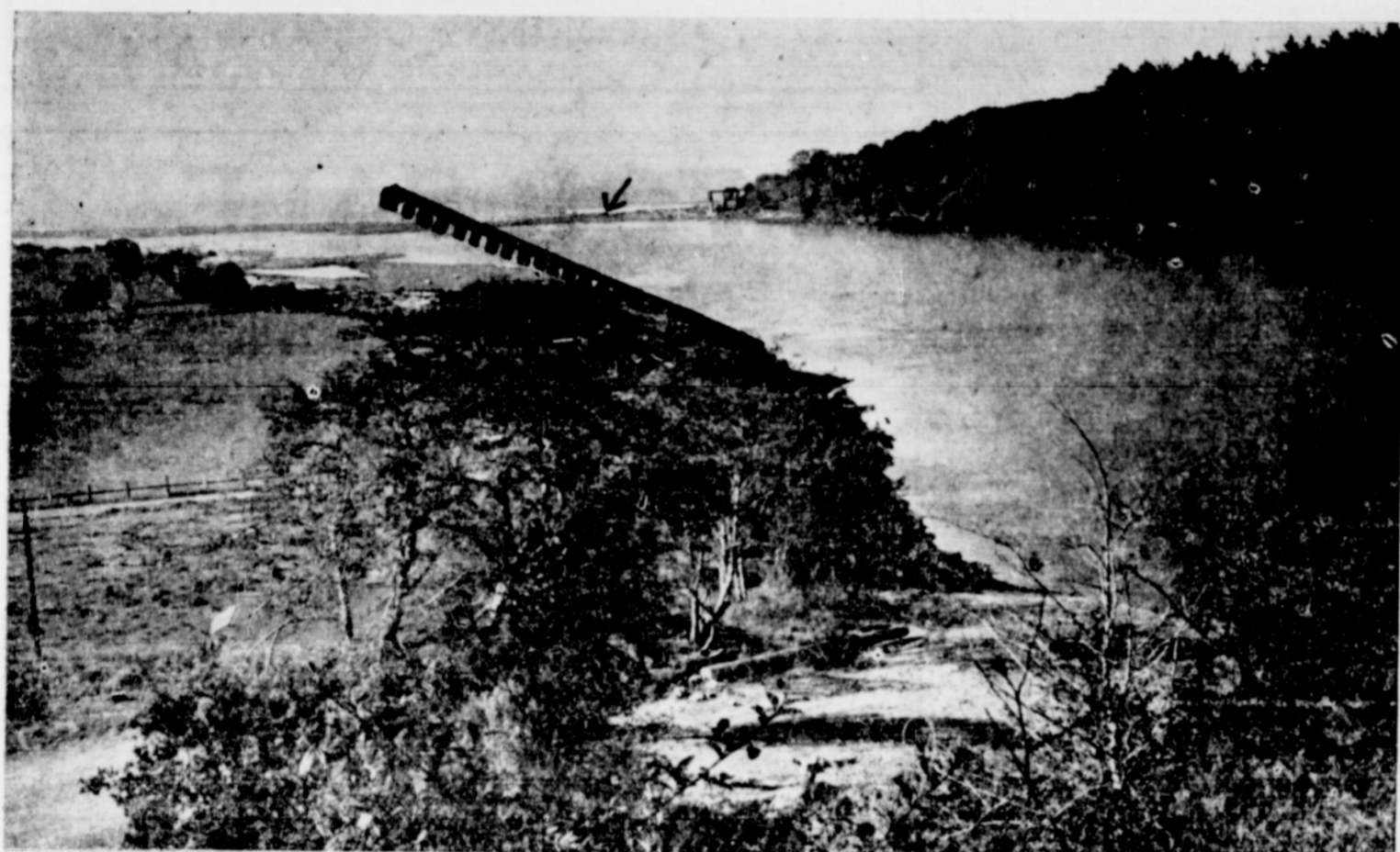
A proposed jetty or breakwater at the mouth of the Chetco would confine the water to the north bank, enabling the river to keep depth and would permit salmon to come up the river in the fall unhampered by shallow water. A committee is at work on this project, and will make an announcement later.