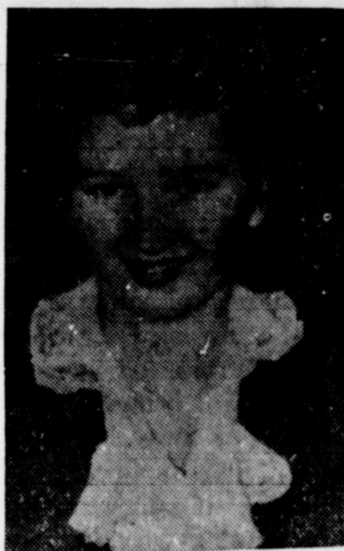
Popular graduate of Brookings High who was married at St. Timothy's Episcopal church last Saturday. She was chosen to Girl State last year.

The list of contributors, more than 100, too long for the limited space in this issue, will be published at a later time, with a complete ambulance story — including the equipment and a picture if one may be obtained.