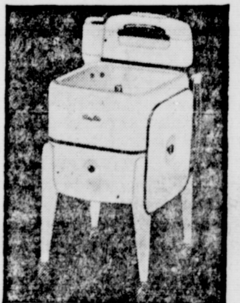
THE MAYTAG COMMANDER, with large, square porcelain tub and fast, efficient Gyrafoam action. $164.95

You're already familiar with Maytag's excellent reputation. You know that here is a washer you can depend on for years and years of faithful service.