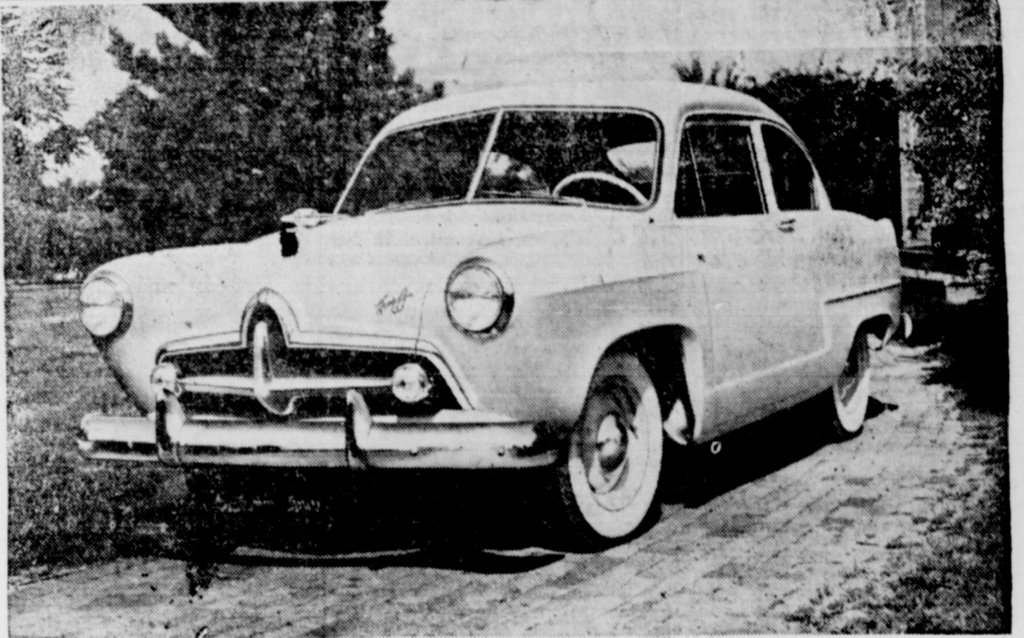
The all-new 1951 Henry J marks the entry of Kaiser-Frazer into the low-priced automobile field. In addition to its low initial price, the Henry J promises great economy of operation and maintenance, including gasoline mileage of 30 miles to the gallon. An exclusive folding rear seat arrangement provides a spacious 50 cubic feet of luggage space.