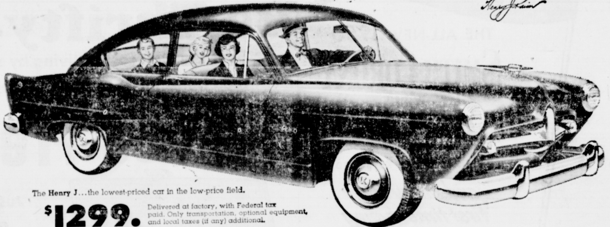
The Henry J...the lowest-priced car in the low-price field. $1299. Delivered at factory, with Federal tax paid. Only transportation, optional equipment, and local taxes (if any) additional.

Today, at your Kaiser-Frazer dealer, you will see what we believe to be the most important car that America has produced since the automobile became a necessity of daily living. It fills the needs, the wants, the purchasing power of all America as no other car has done in the last ten years. It is rugged. It has outstanding maneuverability, handles and parks easily, and is powered with our new Supersonic Engines which deliver up to 30 to 35 miles to the gallon. The Henry J is the lowest-priced car in the low-price field. It has the full, generous proportions to which Americans are accustomed. We have given it the best combination of performance, comfort, styling, and economy of operation. It is the car that you and every American family can afford to buy, to operate, to maintain... and be proud to own.