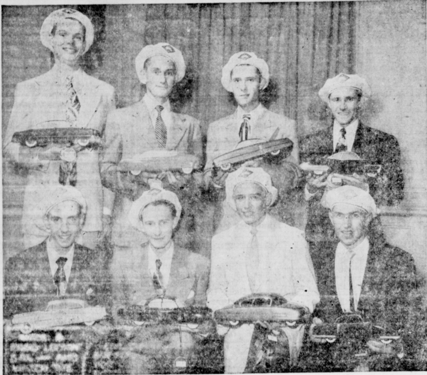
UNIVERSITY BOUND —Eight youthful craftsmen were awarded university scholarships valued at $20,000 at the annual banquet of the Fisher Body Craftsman's Guild in Detroit's Book-Cadillac Hotel. Ranging in value from $1,000 to $4,000 each, the awards were given for proficiency in design and construction of miniature model automobiles entered in the 20th annual