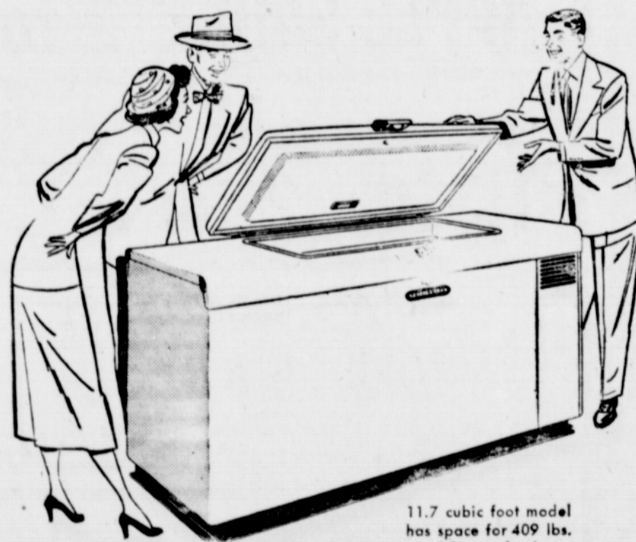
11.7 cubic foot model has space for 409 lbs. of frozen foods.