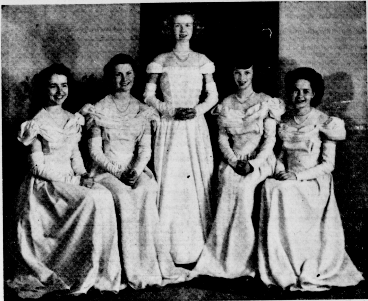
It is always conversation for people who attend the annual Azalea Festivals to wonder about the court of the year previous. The 1949 court, as pictured, l. to