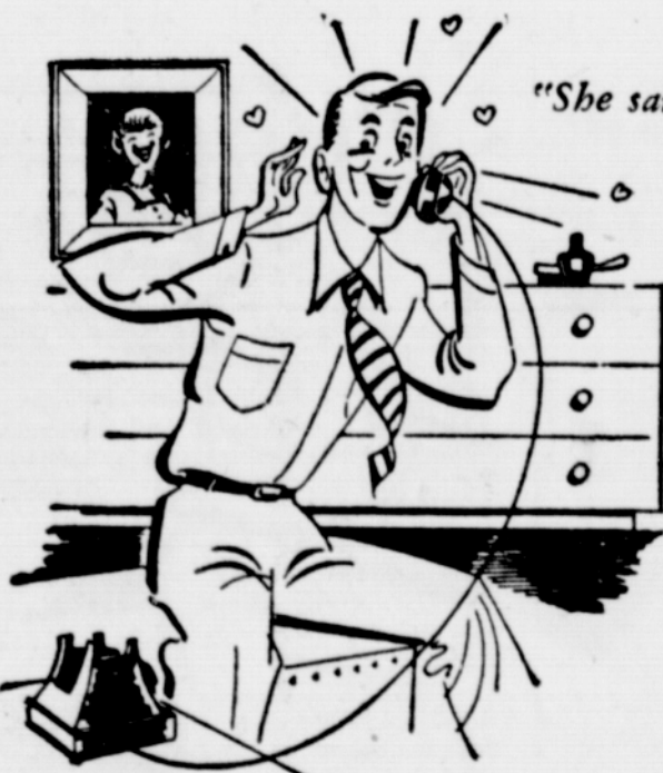
"She said yes"

JUST ARRIVED. A few numbers of new 17-jewel, water resisting, shock proof, non-magnetic WRIST WATCHES Amazing low price (tax inc) of..... $29.75