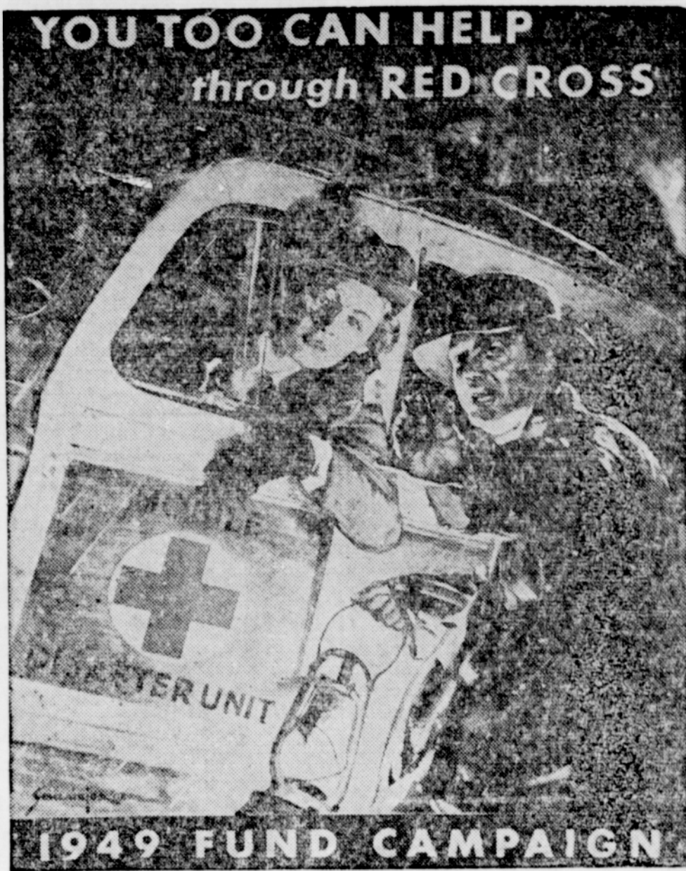
This striking and dramatic picture of Red Cross disaster relief work was done by Jes Schlaikjer, noted American poster artist.