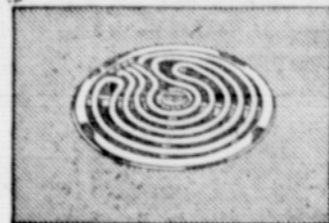
Radiantube 5-Speed Surface Units

These features bring Safe, Clean, Cool cooking!