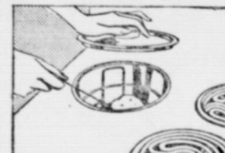
Thermizer Deep-Well Cooker

1-piece porcelain. Easy to clean. Extra thick insulation. Heats to baking temperature in 5 1/2 minutes. Waist high broiler.