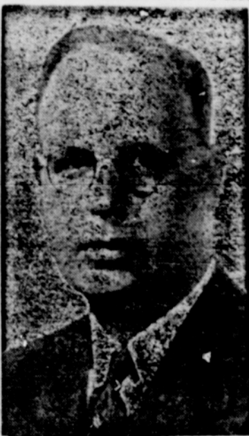
Congressman Harris Ellsworth, of the Fourth District, who will visit this area tomorrow to confer with constituents.

Harris Ellsworth, congressman from the Fourth District of Oregon, and a candidate for re-elec-