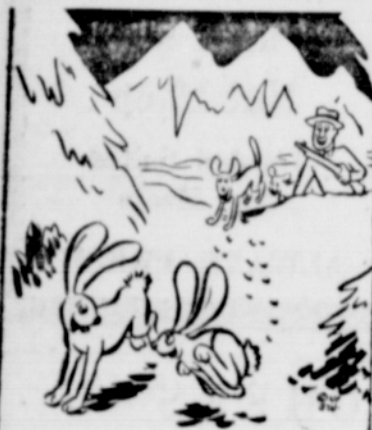
"Shall we stop for a minute and outnumber 'em?"