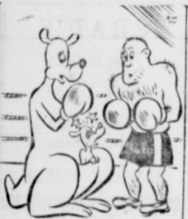
"THAT LAST ONE WAS BELOW THE BELT!"

Our long awaited Simplicity Pattern catalogue has at last arrived. All patterns will be mail order for the present. We also carry a good stock of cotton fabrics and expect rayon and wool yardage in the near future.