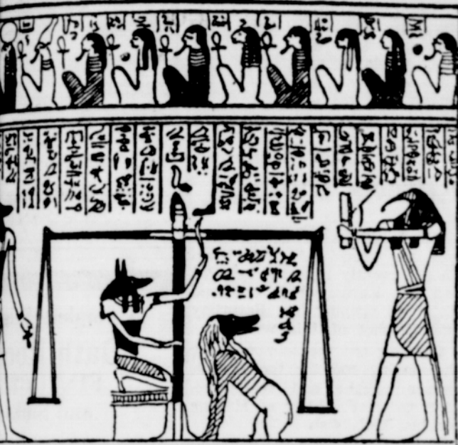
RARE HUNEFER PAPYRUS.—Detail from Egyptian papyrus depicts justice being meted out, with members of court in upper. The jackal-headed Anubis examines the pointer of the balance. The-headed god Toth, scribe of the Gods, notes down the result trial.

Great reliance is placed on the principles underlying the Charter of the United Nations. In a summary of the Egyptian case, it is stated: "At stake in Egypt's dispute with Britain are those very principles for which the Allies