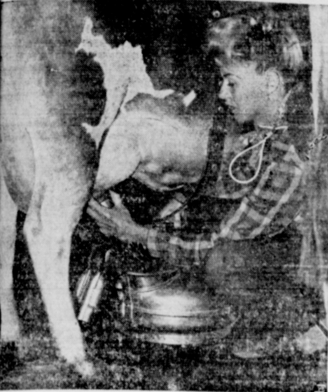
ROGUE RIVER, ORE.— Lovely Ginger Rogers, business woman as well as talented movie star, is the proud owner of a 1,082 acre farm in the rich Rogue River valley of western Oregon. The farm has the latest and best dairy equipment and Ginger takes a turn with the "chores" herself—to relax the routine of Hollywood. Here she applies an automatic milking machine to a prize cow.