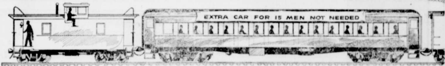
—BUT THE UNION LEADERS WANT 15 EXTRA "SITTERS" ON THIS TRAIN . . . 3 ENGINEERS, 3 FIREMEN, 6 BRAKEMEN AND 3 CONDUCTORS . . . TO GO ALONG FOR THE RIDE AT FULL PAY!