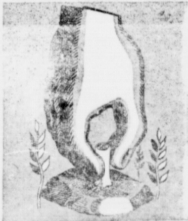
Crush out your cigarette

Don't fail to see "Pete" if you contemplate purchasing real estate!