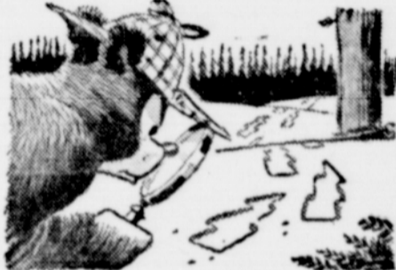
Smokey decided to find out who starts the most forest fires. First he tracked down old man Lightning. But lightning and other natural causes start less than 10% of the fires.