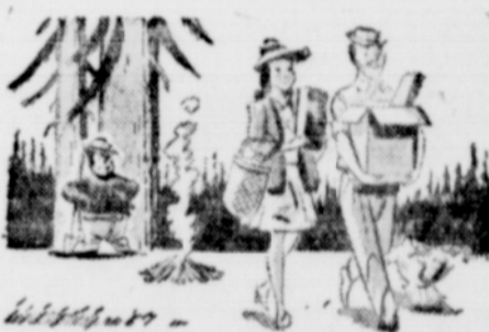
That eliminated all suspects except . . . except . . . could that be right? Yes, good American citizens like you start 9 out of 10 forest fires! And do the big damage to our forests!