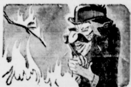
Next he turned to criminals, or crazy firebugs. But although these people start some of the worst forest fires, Smokey didn't get the final answer here. So . . .