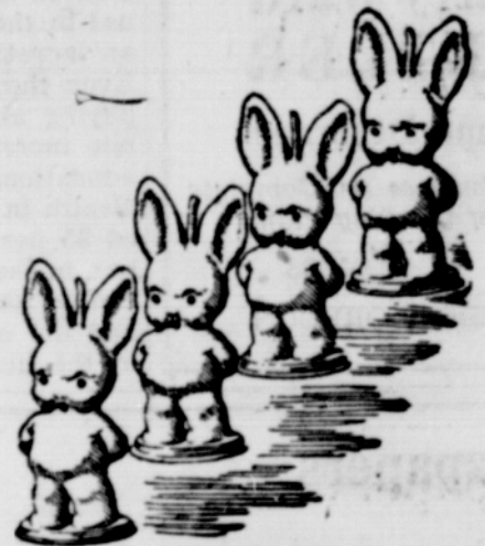
4 Small Bunnies . . . . . 65¢ 3-in. high. In Gift Box