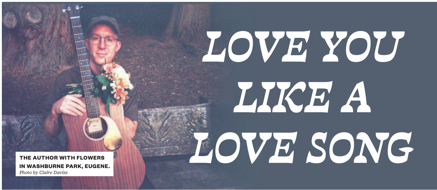
THE AUTHOR WITH FLOWERS IN WASHBURNE PARK, EUGENE.