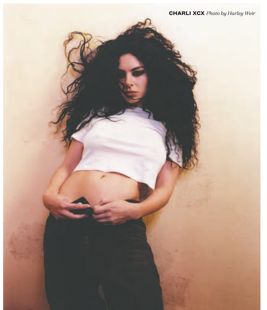
CHARLI XCX