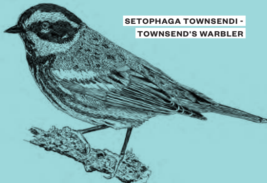
SETOPHAGA TOWNSENDI - TOWNSEND'S WARBLER

Along the trail to Trestle Creek Falls, above Brice Creek in southern Lane County, I found a solitary, ancient rock sword fern ( Polystichum imbricans ). It is a relictual plant, one that has survived from the time when this site was an open, rocky ridge. That's the sunny habitat this species prefers. Over the last centuries a towering forest has closed in and this species is no longer reproducing here. These relictual oldsters are not hard to find because our regional forests have an average 500-year cycle of fire replacement.