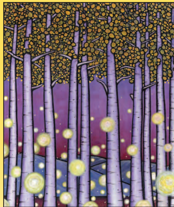
Artist: Sachiko Quinn

One-Day Adult: $10 4-day ticket: $30 Youth 6 - 14 years: $5 3-day ticket: $25 Under 6: FREE One-day VIP ticket: $25 BI-MART Members: 1-day ticket: $9 (Purchase at Bi-Mart)