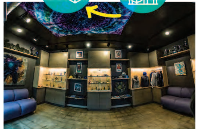
inside the dispensary