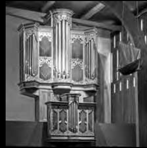
The Brombaugh Organ at Central Lutheran Church "One of the musical treasures of Western America."

A special outreach concert for the community sponsored by Central Lutheran Church's St. Cecilia Music Endowment Fund