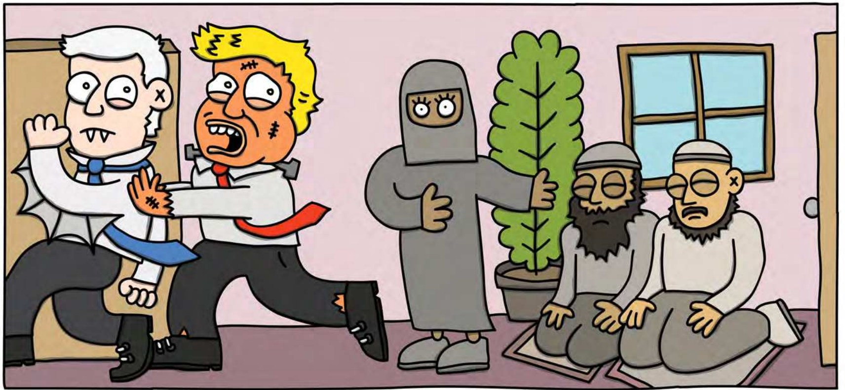
If you've made it this far in the hell house, then it's time for your worst alt-right nightmare. Those Muslims are just praying, but you know that's a threat. Heads up! That one's trying to board a plane!