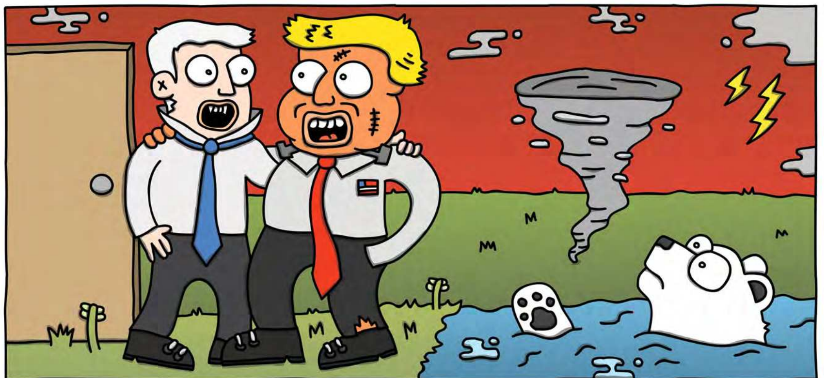
You made it through the House of Horrors! Congrats! And just ignore that polar bear. Remember, climate change isn't real!