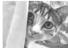
Meet hazel! Hazel likes to destroy things, nap in the sun, and sit by the window. She's the best