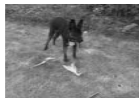
Rudy! The best, kindest most joyful pup. We love you!