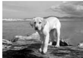
Chase! You are a good dog. Chase, you are a bad dog... Chase you are good dog. Either way we all love you.