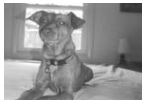
Poko! You're a scamp and love eating things you shouldn't, but we love you so much anyways. You're one good pup.