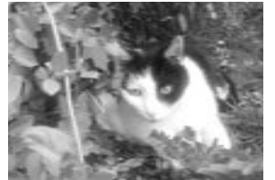
Surprise the Cat: You can bite us all you want, but deep down we know you're a good kitty.