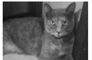
This is Blaze. I love her, but she's kind of a snot. Her sister, Velcro, is a lot nicer.