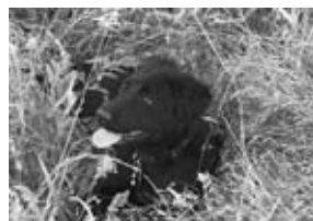
Misty is a lab mix whose favorite activities include digging, jumping through grass, and chasing bugs. She is 6 months old.