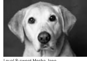
Loyal & sweet Mocha Jane