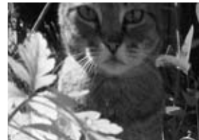
Moonshine, Little Chinner, Shine-Shine, Rat-Cat. Light of our lives.