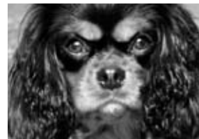
Everyday is a Misha day or what else would it be?!