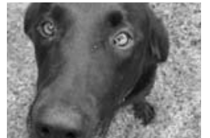
Zip, the sweetest girl